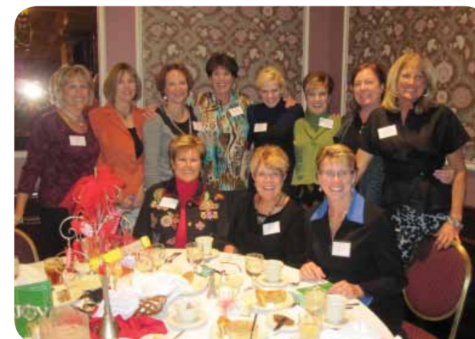
As always, the annual holiday boutique and luncheon was a popular event, raising more than $85,000 to help ill and injured kids and their families.