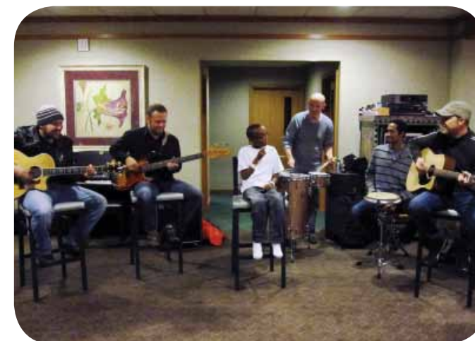
Kids and families sang and danced up a storm when the Love Monkeys, a favorite local band, performed an interactive concert at the House. "We can't wait for them to come back!" says one budding new rock star.